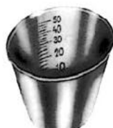
PAF. 22.50 50 cc