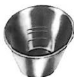
PAF. 22.25 25 cc