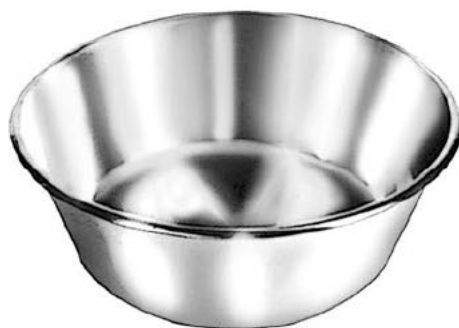
PAF. 05.82 ø 200 x 70 mm