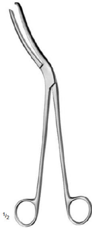
CHEATTLE PR. 03.27 27 cm / 10 1/2"