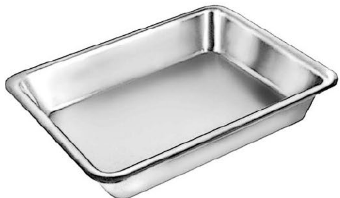
PAF. 05.63 235 x 190 x 40 mm

L = Length W = Width D = Depth ø = Diameter