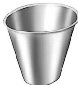
PAF. 23.90 ø 90 x 90 mm, height