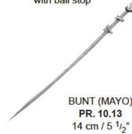
BUNT (MAYO) PR. 10.13 14 cm / 5 1/2"