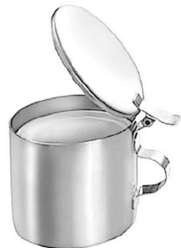
PAF. 20.80 ø 80 x 90 mm